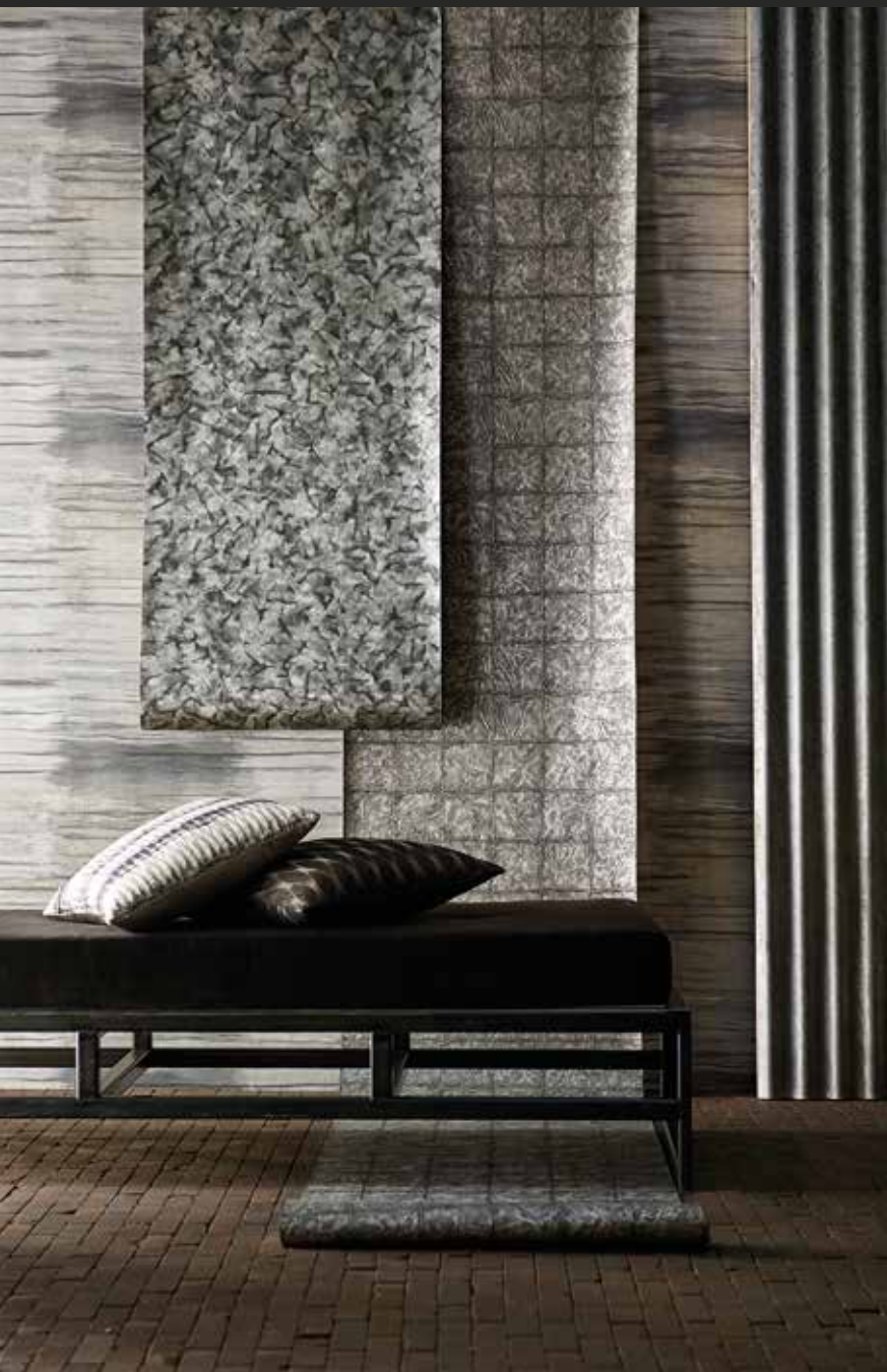
WALLCOVERINGS A selection from Anthology 04 UPHOLSTERY Veda 131700 CUSHIONS (L-R) Transluents 01, Kiyoshi 131814, Cazimi 131740