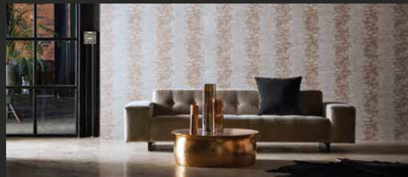
WALLCOVERING Yuti 111347 THROW Textures 01, Cambium 131813 CUSHIONS A selection from Anthology Fabrics