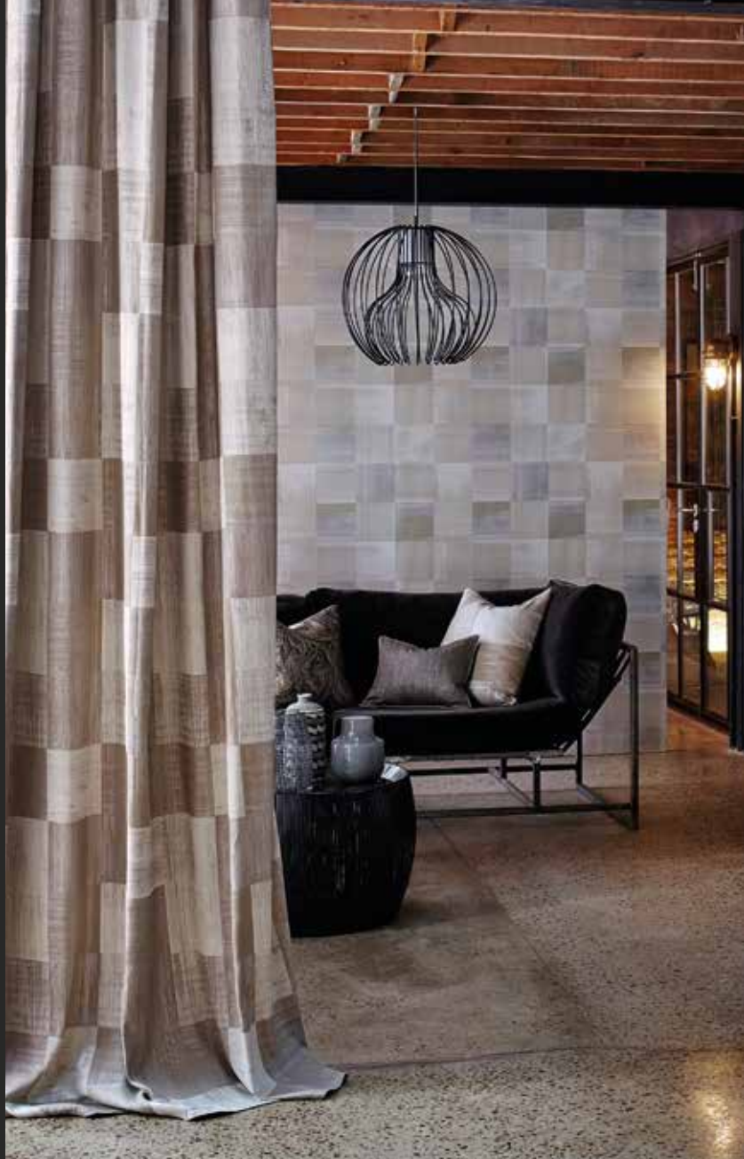
WALLCOVERING Anthology 02 Bloc, 110735 CURTAINS Textures 01, Bloc 131766 UPHOLSTERY Veda 131700 CUSHIONS A selection from Anthology Fabrics