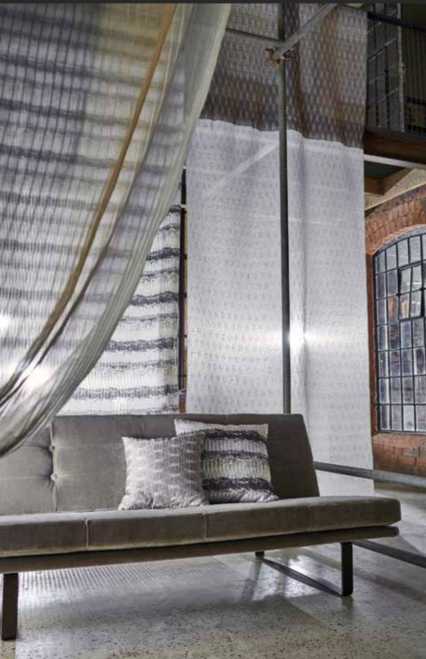
VOILES Transluents 01, Stria 131795, Kiyoshi 131814, Cazimi 131734 UPHOLSTERY Veda 131694 CUSHIONS (L-R) Transluents 01, Cazimi 131737, Kiyoshi 131814