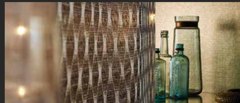
VOILES (L-R) Transluents 01, Yuti 131803, Kiyoshi 131815 UPHOLSTERY Veda 131698, 131709 CUSHIONS A selection from Anthology Fabrics